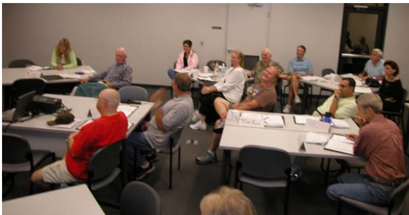
CPA class learning about SWAT operations during a previous class