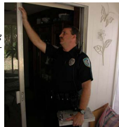
Officer conducting home security survey.

Due to the scope & variety of the division's tasks, officers work a variety of hours fulfilling the Division's responsibilities. So the next time you hear reference to the Department's Community Policing Unit, you now have an idea of what they are all about.