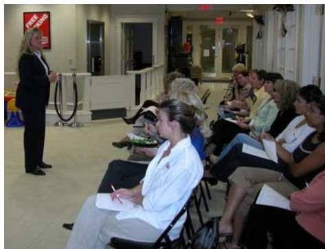
Mock Bank Robbery presentation being conducted.

The rest of the unit is responsible for a host of other tasks including: Neighborhood Watch, Neighborhood & Commercial crime prevention, Bicycle patrol, Sexual offender monitoring, Crime Prevention seminars, Professional Standards, Department training, Recruitment and Hiring, Business Watch, Gang intelligence, Media Relations, Fingerprinting, Public Information Officers, maintaining the Department Volunteer and Internship programs, Internal and External Department Communications, Maintaining the Department website, Intra-City department Liaisons, Background Investigations, and the Citizen's Police Academy.