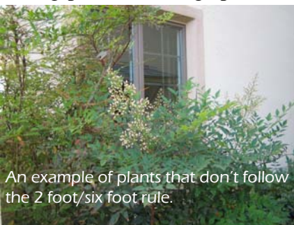
An example of plants that don't follow the 2 foot/six foot rule.

unwanted persons from trespassing. If you already have mature landscaping in place, you should try to adhere to the two foot/six foot rule. This rule essentially states that all ground cover should be trimmed so that it is no higher than two feet off the ground and that tree canopy should be trimmed so that it is a minimum of six feet above the ground. By following these guidelines, you should be able to maintain an unhindered view across your property thus eliminating possible hiding spots for