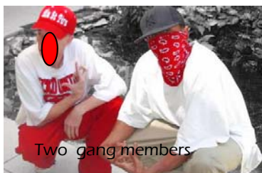
Two gang members

The responsibilities that certain divisions within the Police department have are self evident by their name. For example the Traffic division deals with all things traffic and the Detective division investigates cases that are reported. But when you hear of the division called Community Policing, the purpose of the unit is not so apparent. The Community Policing Unit is responsible for many different facets of the Police Department.